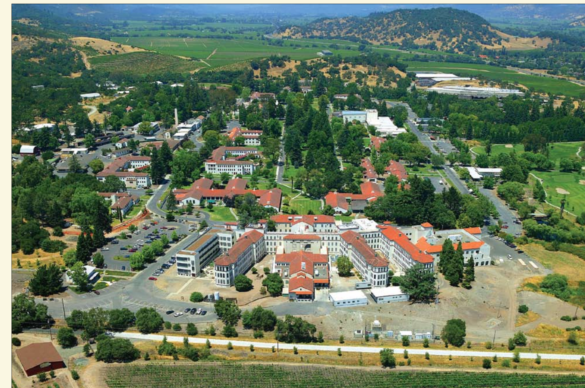
Aerial photo of Veterans Home today.

Civil War. The home is listed as California Historical Landmark No. 828.