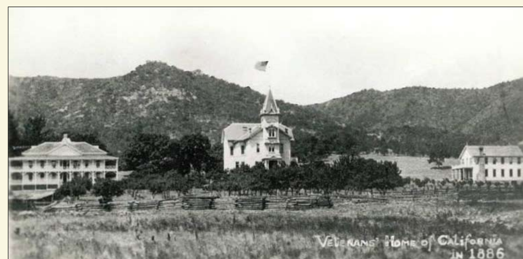
First Buildings, 1886